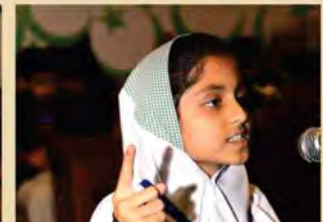
All Pakistan Speech Competition