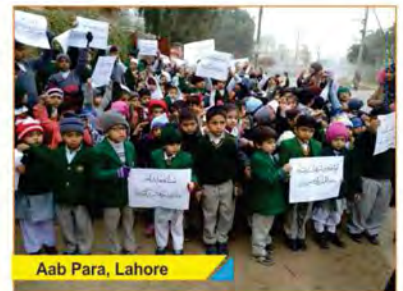
Aab Para, Lahore