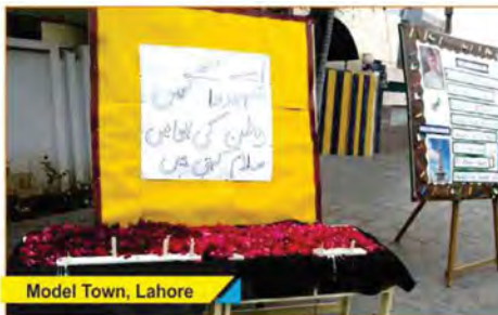
Model Town, Lahore