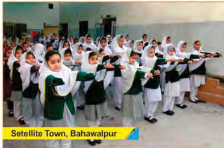
Setellite Town, Bahawalpur